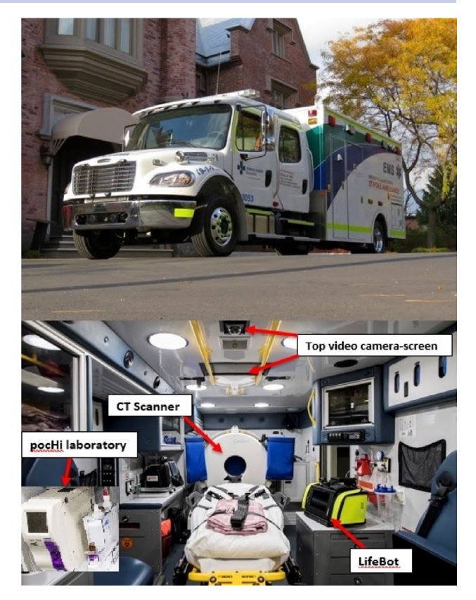
Figure 1 Mobile stroke unit based at the University of Alberta Hospital in Edmonton. The ambulance is equipped with a CT scanner, 'point-of care' laboratory and telemedicine equipment. The personnel deployed include one stroke fellow, two paramedics and a radiology technologist.

The MSU was implemented at the UAH in February 2017 as the 'first of its kind', novel technology in Canada with the primary objective of expanding timely assessment and treatment of patients with suspected hyperacute stroke residing in communities without timely access to CT imaging in Northern Alberta' (figure 1; stroke ambulance). The MSU is a custom-built ambulance (Demers, Beloeuil, Quebec, Canada) with a portable CT scanner (CereTom; Samsung, Boston, Massachusetts, USA), telestroke equipment (LifeBot, Phoenix, Arizona, USA) and 'point-of care' laboratory to perform a complete blood count, glucose and International Normalised Ratio (INR, (pocHi; Sysmex Canada) measurements. The specialised MSU team consists of a stroke fellow, CT technologist, registered nurse, primary care paramedic and advanced care paramedic. MSU catchment area is within a 250 km radius surrounding the UAH (figure 2). The operational design for deployment of the MSU is shown in figure 3. In brief, the MSU is dispatched by the UAH telestroke neurologist after telephone consultation with the rural ED physician. The Alberta Stroke Program based in Edmonton and Calgary is linked via an acute care hotline to all rural hospitals in the province. The admission of a 'suspected acute stroke' to any of the rural hospital