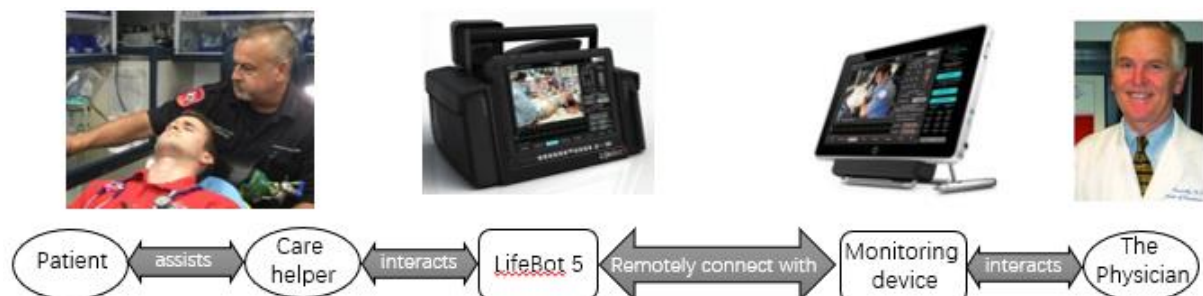
Figure 1: the physician remotely connects with the patient, collect rich data and make fast informed decision

Lifebot is distinct in that it is able to store data internally if a connection is lost and transmit when the connection is re-established. It uses an ID scanner that is able to scan a patient's driver's license to obtain demographic data and is secure using advanced encryption standard in order to meet HIPPA standards through cloud-based VPN. Lifebot can connect with up to four additional external cameras that the physician can control from the clinical work station remotely allowing the provider multiple views of the patient.