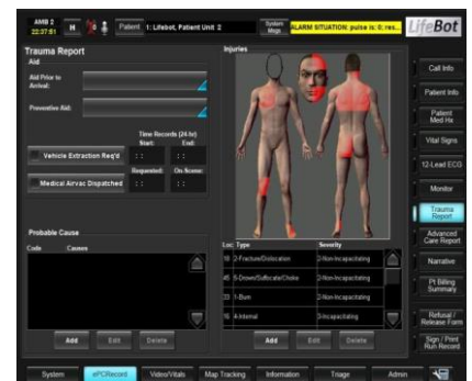
Figure 3: A screen from the emergency run record display at the paramedic mobile workstation in the ambulance

Fortunately, the ambulance is equipped with a Lifebot allowing the physician real time physiologic data and audiovisual to assist the EMS in diagnosis and treatment.