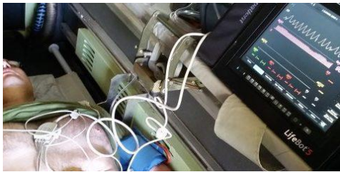
Figure 3 : General Dynamics uses LifeBot for its Light Armored Vehicle Ambulance

Telemedicine can assist patients who need urgent or acute care. Providers leveraging advanced telemedicine technology can connect virtually with patients to replicate the collaborative decision making care environment of a hospital. We have provided sample use cases that highlight how EMS can utilize telemedicine in different settings to improve patient outcomes.